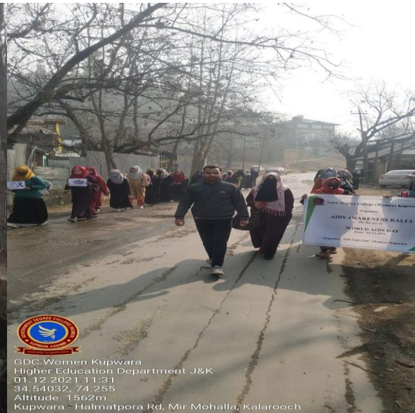
GDC Women Kupwara Higher Education Department J&K 01.12.2021 11:31 34.54032, 74.255 Altitude: 1562m Kupwara - Halmatpora Rd, Mir Mohalla, Kalarooch