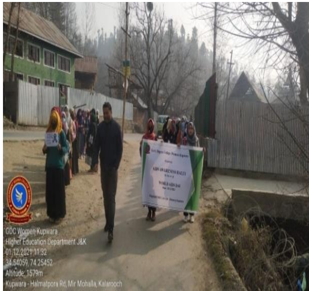
GDC Women Kupwara Higher Education Department J&K 01.12.2021 11:32 34.54059, 74.25452 Altitude: 1579m Kupwara - Halmatpora Rd, Mir Mohalla, Kalarooch